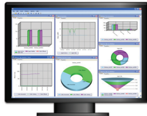
Figure 2: Real time and historical reporting: An accurate snapshot of complete CC activity

Enterprises and organizations can achieve these benefits while preserving existing infrastructure investments and enhancing flexibility, tightening security, augmenting service availability and saving CAPEX and OPEX.